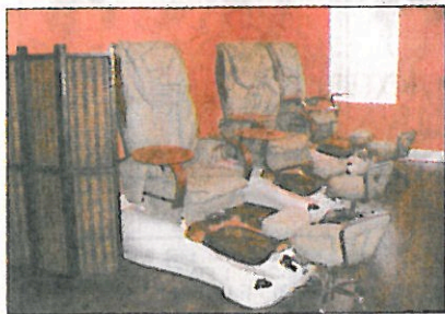
C. Roland Craeye SIGNATURE TOUCH DAY SPA